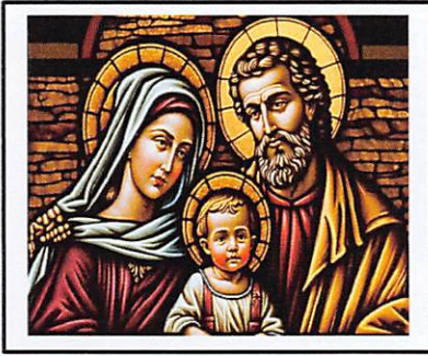
The Holy Name of Jesus