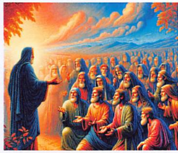
Our Lady of The Rosary