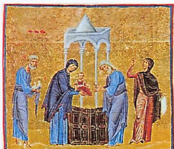
The Holy Family